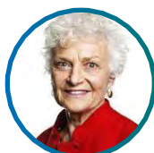
Prof Fiona Stanley AC Patron Telethon Kids Institute and Distinguished Professorial Fellow, Uni of WA